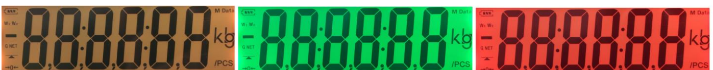
Adjustable Tri-Color Check Result Backlight

19i always deliver more than it is expected and the #1 choice whenever & wherever performance, reliability, durability and flexibility are of no compromise.